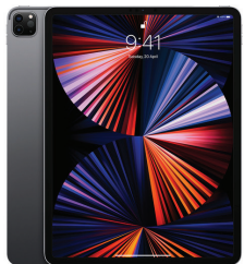
12.9-inch iPad Pro Wi-Fi