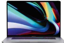
16-inch MacBook Pro