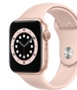
Apple Watch Series 6