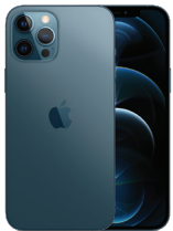
iPhone 12 Pro Max