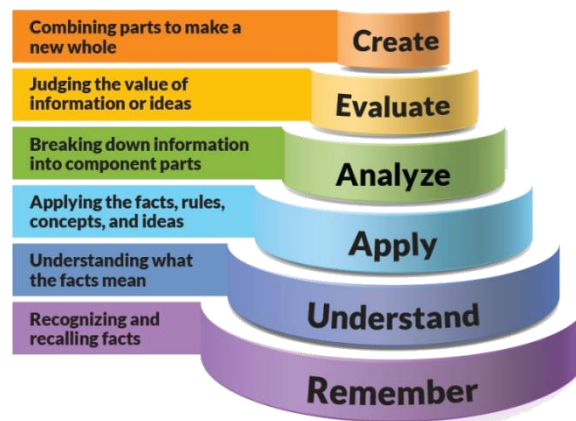
Figure 1: Blooms Taxonomy

(Blooms taxonomy has been given for reference)