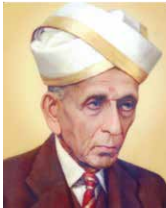
Bharat Ratna Sir M Visvesvaraya

September 15 is celebrated every year in the country since 1967 as "Engineers' Day" to commemorate the birthday of the legendary engineer Sir Mokshagundam Visvesvaraya. Sir Visvesvaraya, an eminent Indian engineer and statesman was born in a remote village of Karnataka, the State that is incidentally now the Hi-tech State of the country. Due to his outstanding contribution to the society, Government of India conferred "Bharat Ratna" on this legend in the year 1955. He was also called the precursor of economic planning in India. His learned discourse on economic planning in India, Planned Economy for India and Reconstructing India, was the first available document on the planning effort of the country and it is still held as the parent source matter for economic planners. A theme of national importance is chosen every year by the Council of the Institution and deliberated at its various State/Local Centres to educate the engineering fraternity in general and the society in particular. This year the 52nd Engineers' Day will be celebrated all over the country and the Council of the Institution has selected the theme as "Engineering for Change" to mark the occasion.