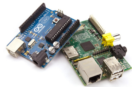
Hands on Training sessions on Internet of things at Indus University

Indus University Students : Rs. 1000/-Other University Students: Rs. 1500/-